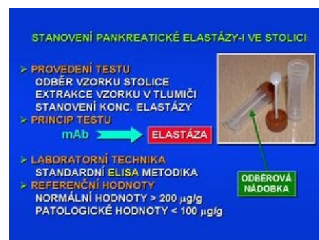
Stanovení pankreatické elastázy-1 ve stolici

Referenční hodnoty jsou 200–500 µg/g stolice , hraniční pásmo je 100–200 µg/g, závažná pankreatická insuficience je stanovena při hodnotách < 100 µg/g stolice. Imunochemické stanovení elastázy-1 není ovlivněno pasáží tlustým stěvem, substituční terapií ani jinými faktory, které ovlivňují enzymové stanovení chymotrypsinu ve stolici. Specifita metody je 93 %, senzitivita dosahuje pro těžkou pankreatickou insuficienci hodnoty 100 %, pro střední a lehké formy 87%. Tento test je běžně používán v pediatrii k průkazu cystické fibrózy se specifitou i senzitivitou téměř 100%. Falešná snížená hodnota může být způsobena zředěním (obsahem vody) při průjmu.